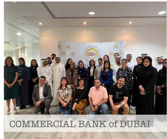
COMMERCIAL BANK of DUBAI