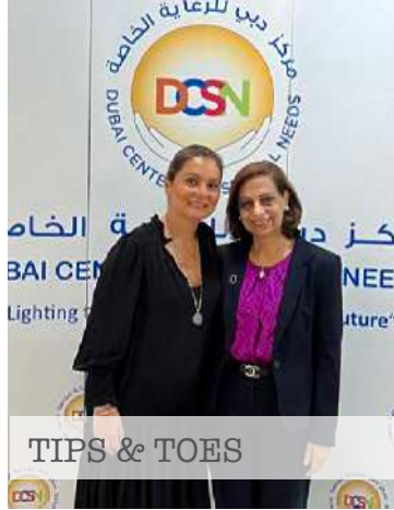
TIPS & TOES