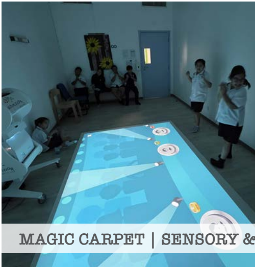
MAGIC CARPET | SENSORY & EDUCATIONAL SESSIONS