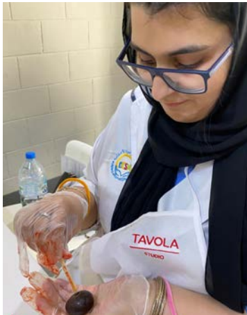
TAVOLA WORK PLACEMENT

Beyond the workplace, students took part in cooking sessions that sparked creativity and independence, refreshing swimming lessons that built confidence and physical strength and an empowering first aid training conducted by Dubai Ambulance in partnership with AccessAbilities Expo, equipping them with valuable knowledge. Each of these moments plays an important role in helping our students prepare for the future.