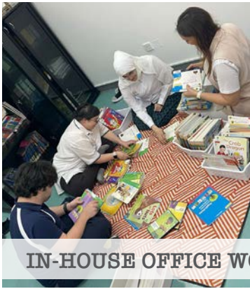
IN-HOUSE OFFICE WORK PLACEMENT