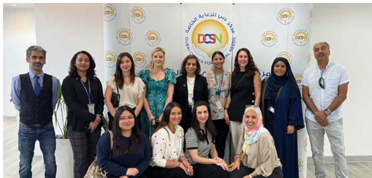
Al TAMIMI & Co