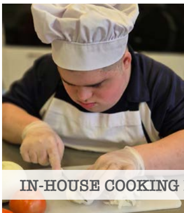
IN-HOUSE COOKING LESSONS