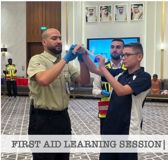
FIRST AID LEARNING SESSION | Able to Save Lives