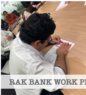
RAK BANK WORK PLACEMENT