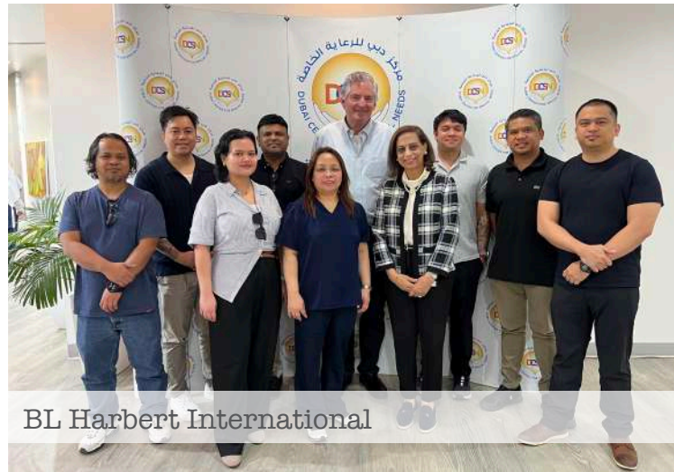
BL Harbert International